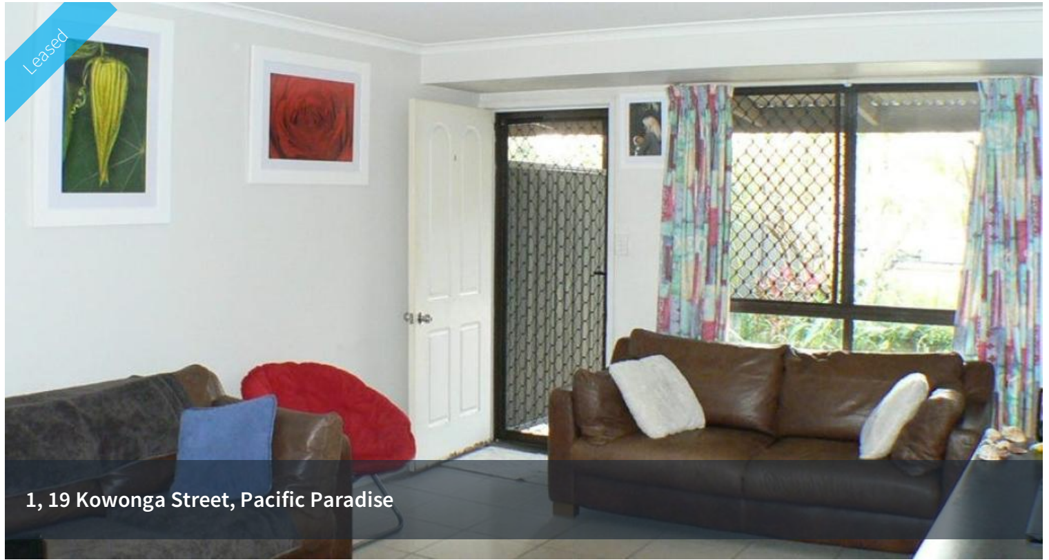
1, 19 Kowonga Street, Pacific Paradise