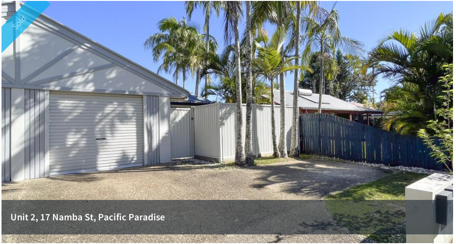
Unit 2, 17 Namba St, Pacific Paradise