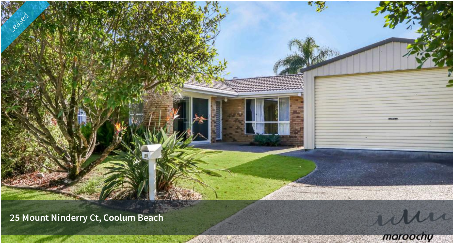
25 Mount Ninderry Ct, Coolum Beach