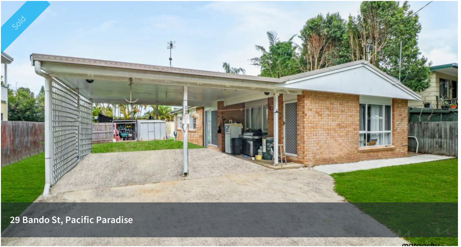
29 Bando St, Pacific Paradise