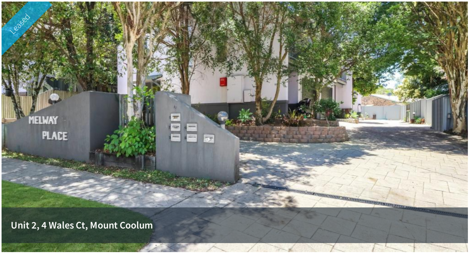
Unit 2, 4 Wales Ct, Mount Coolum