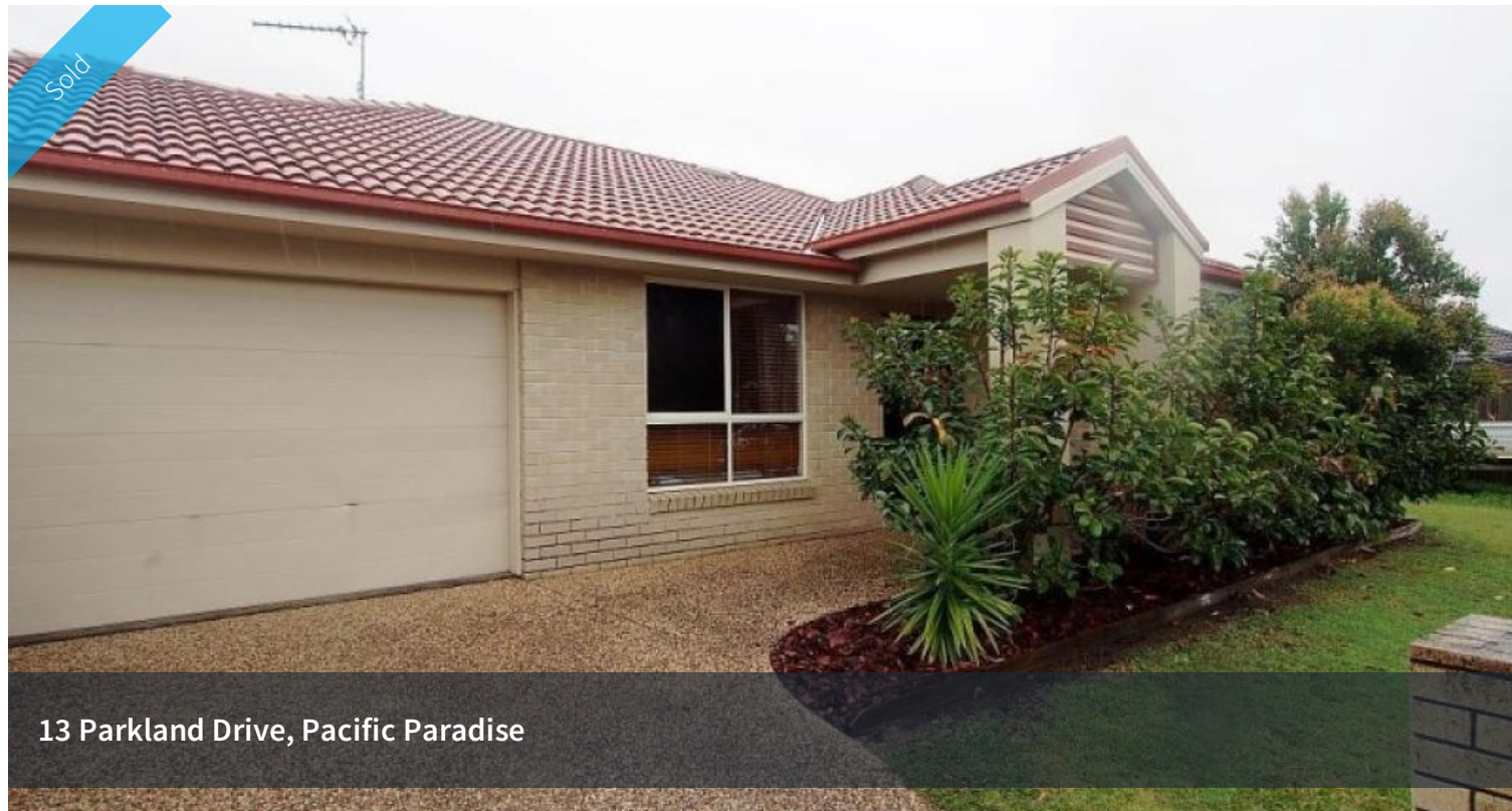
13 Parkland Drive, Pacific Paradise