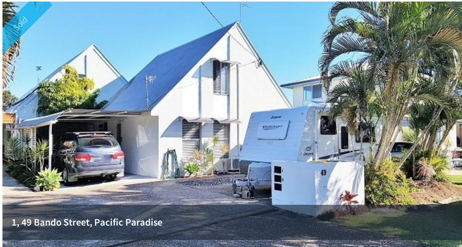
1, 49 Bando Street, Pacific Paradise