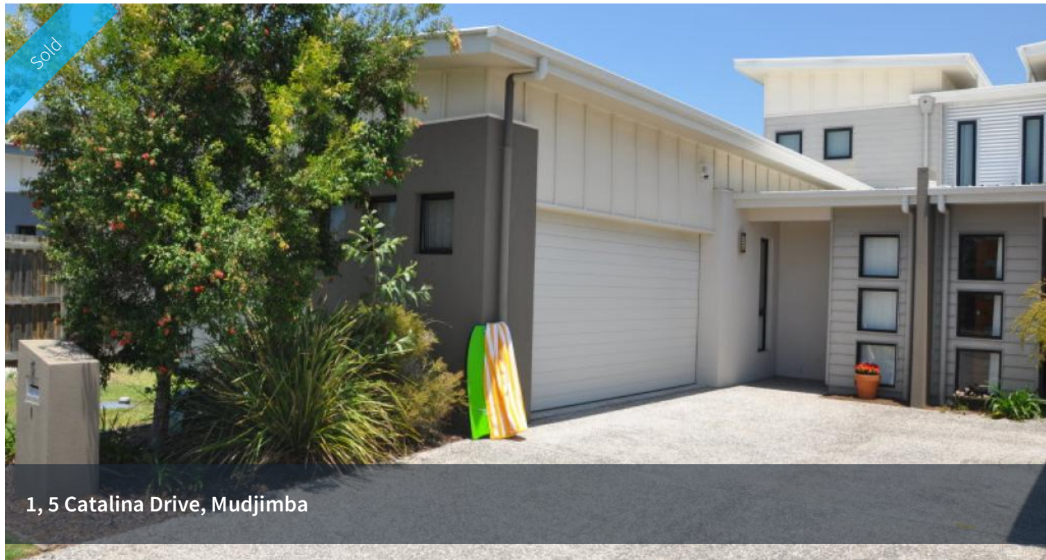
1, 5 Catalina Drive, Mudjimba