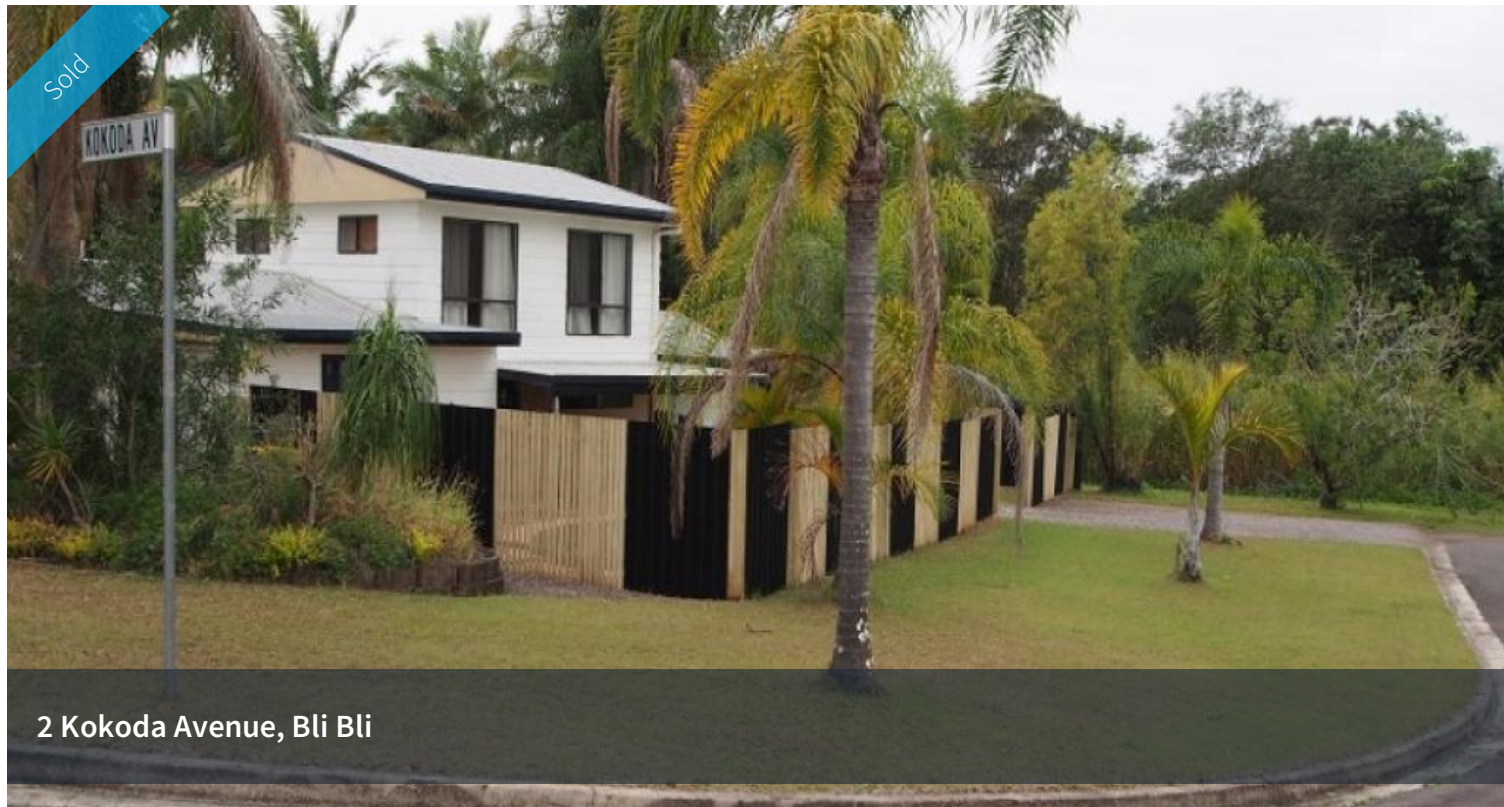
2 Kokoda Avenue, Bli Bli