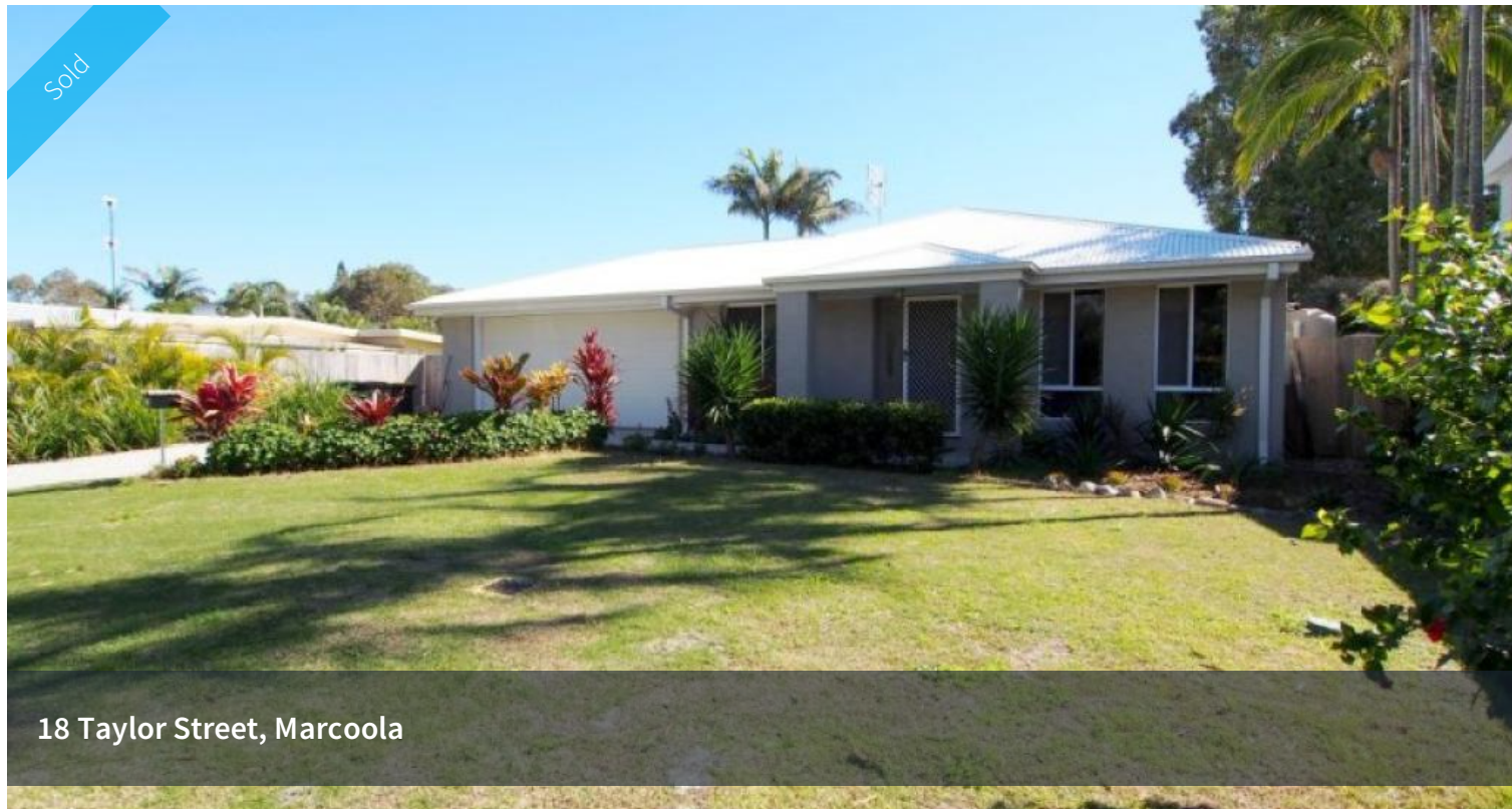
18 Taylor Street, Marcoola