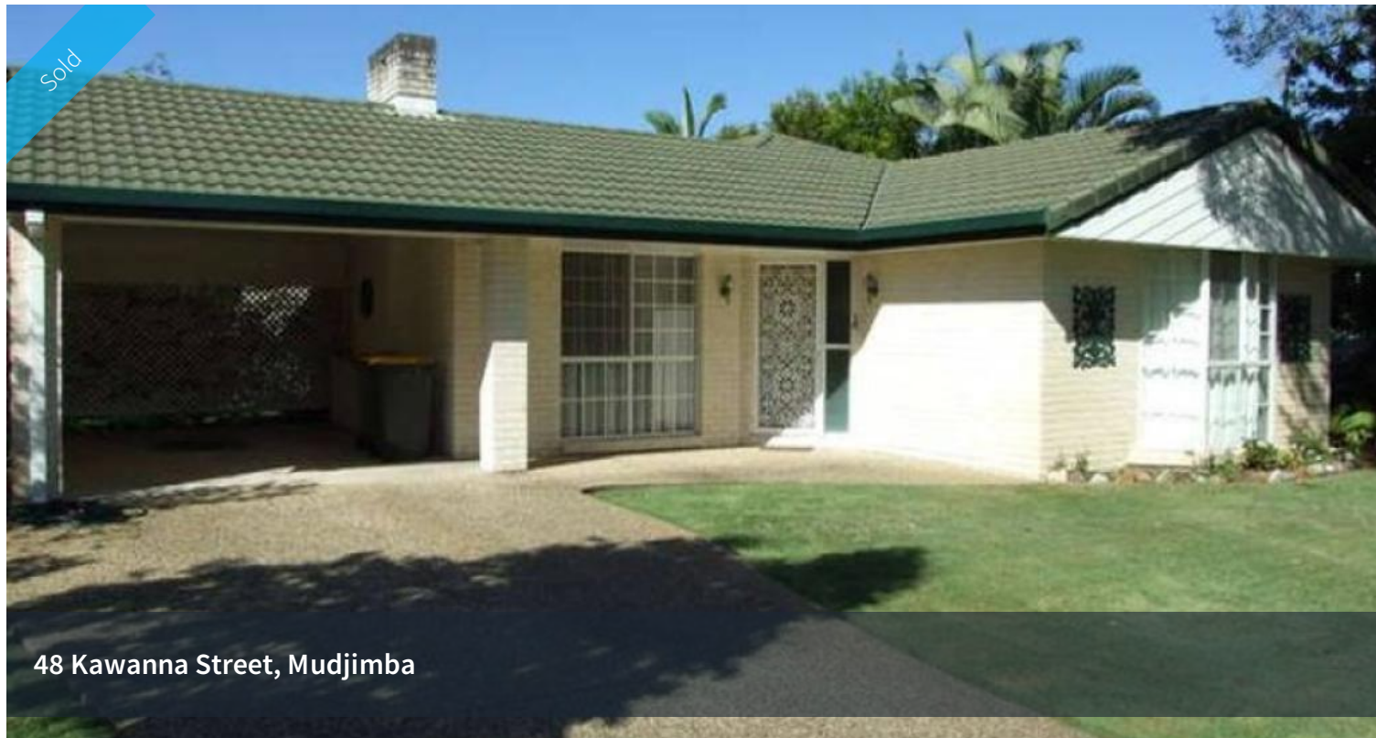
48 Kawanna Street, Mudjimba