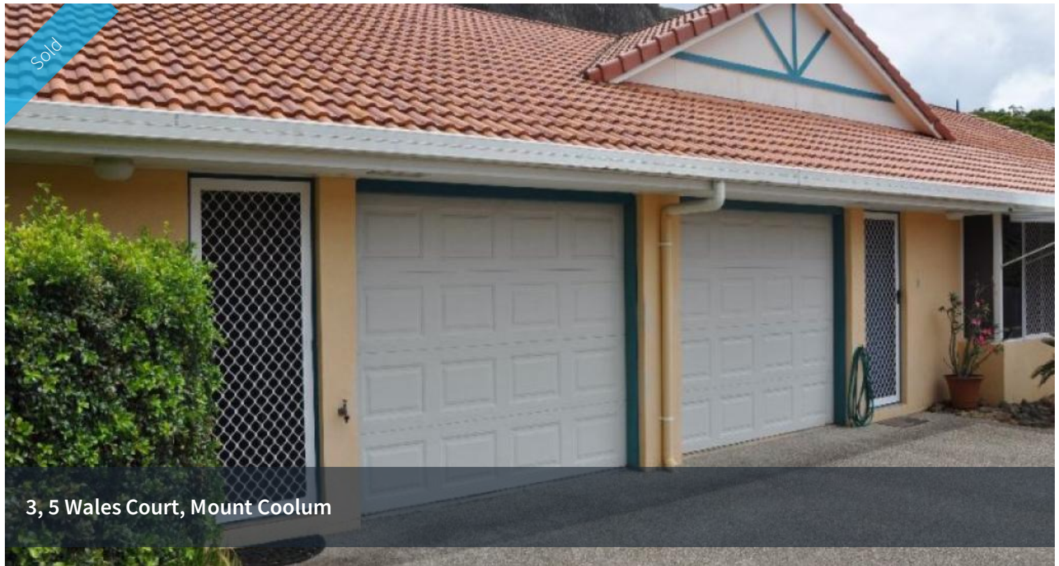
3, 5 Wales Court, Mount Coolum