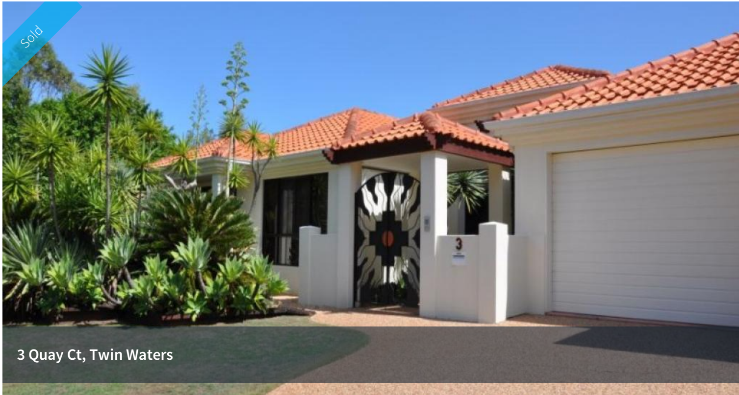
3 Quay Ct, Twin Waters