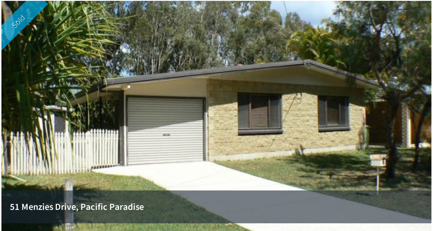
51 Menzies Drive, Pacific Paradise