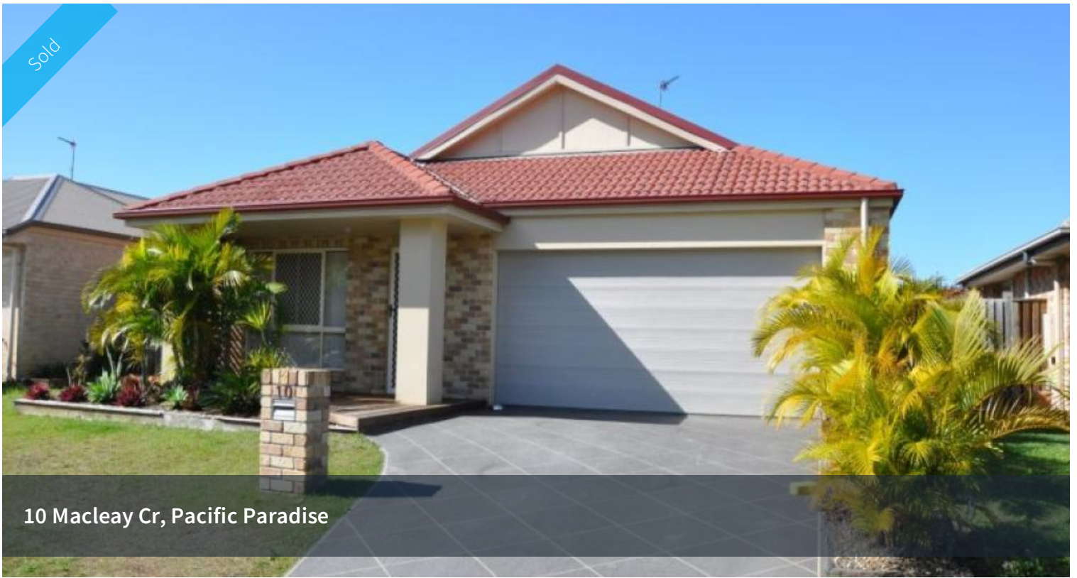
10 Macleay Cr, Pacific Paradise