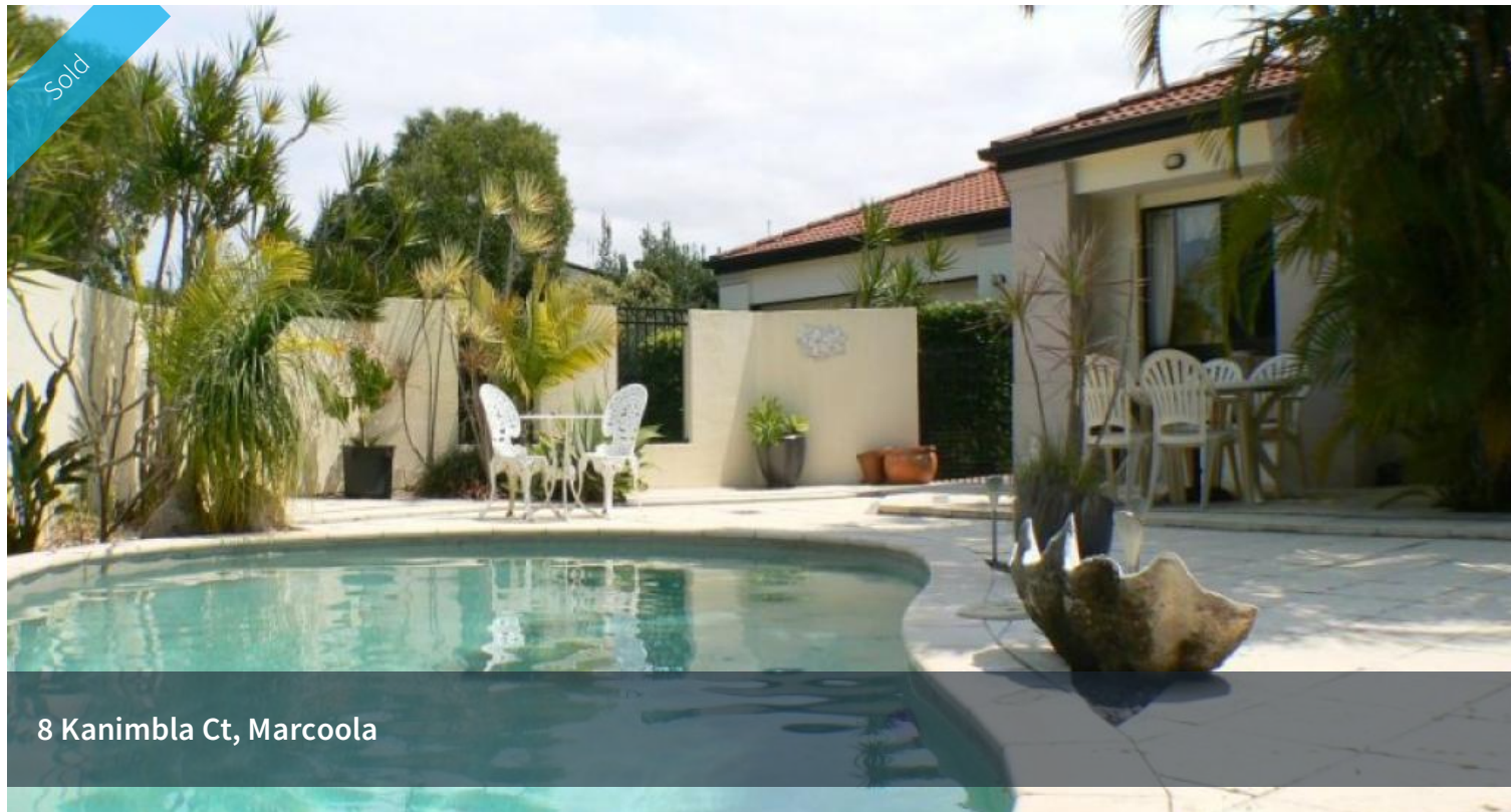
8 Kanimbla Ct, Marcoola