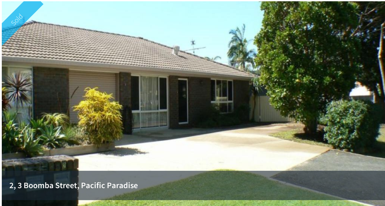
2, 3 Boomba Street, Pacific Paradise