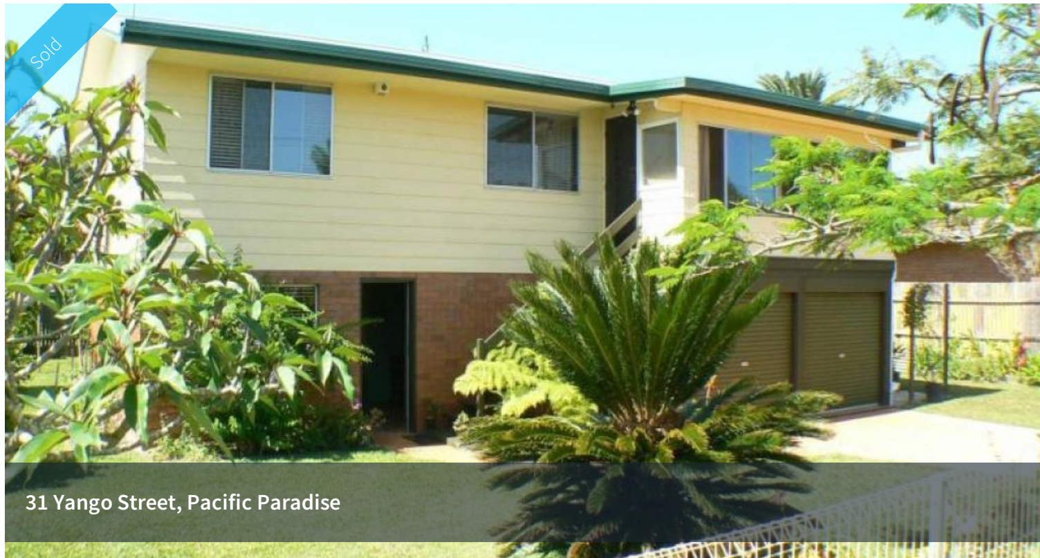
31 Yango Street, Pacific Paradise