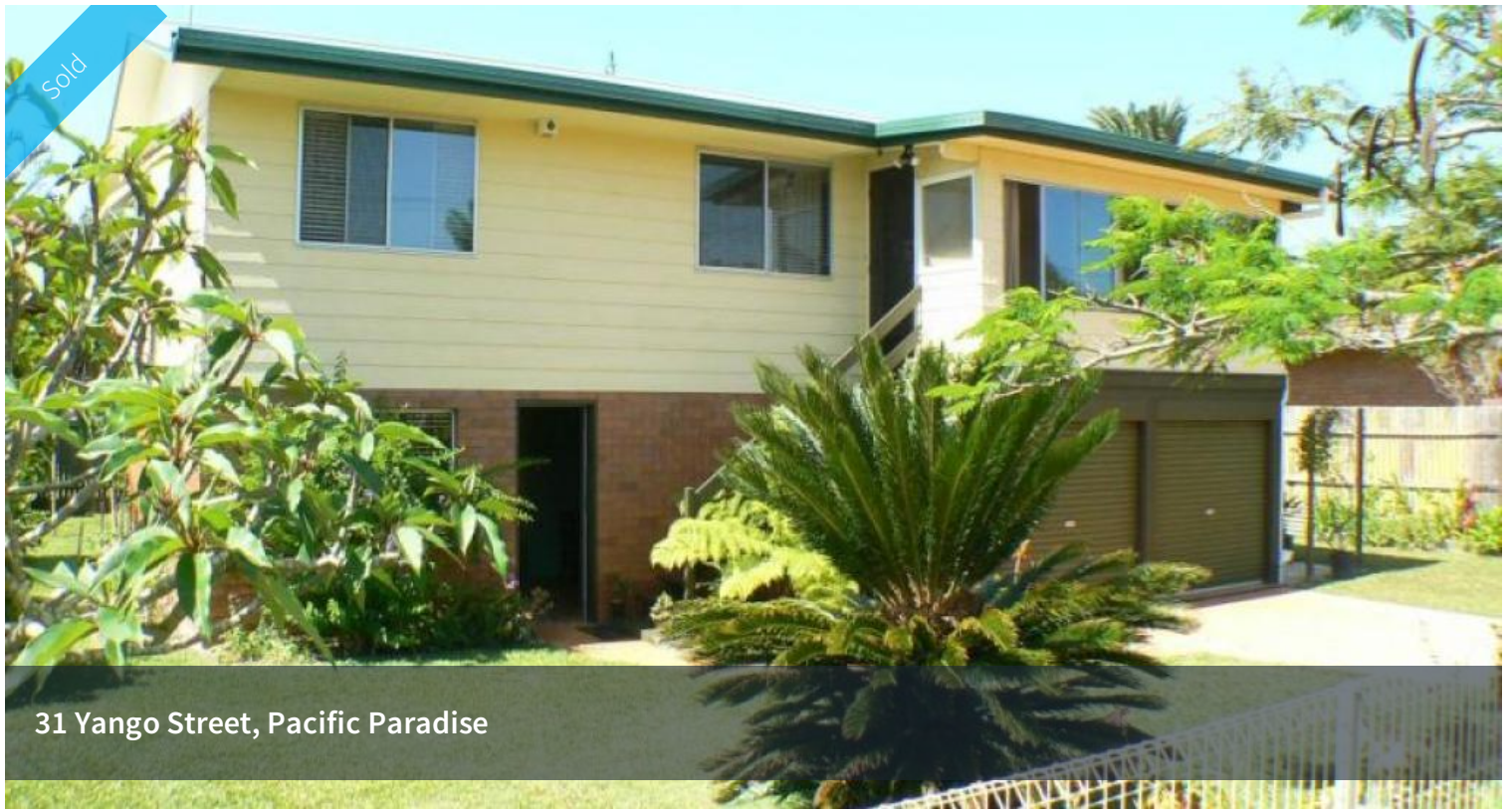
31 Yango Street, Pacific Paradise