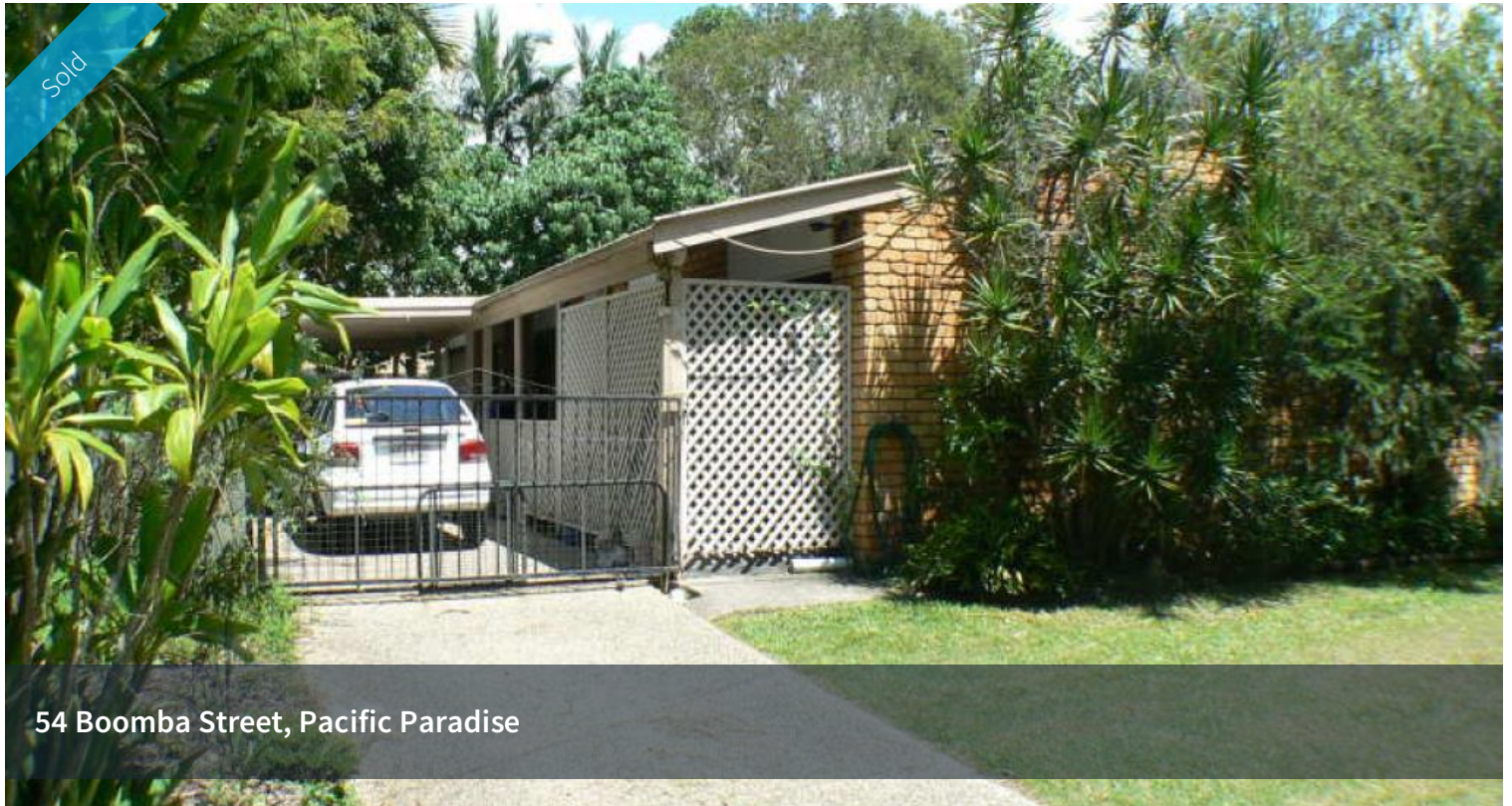
54 Boomba Street, Pacific Paradise