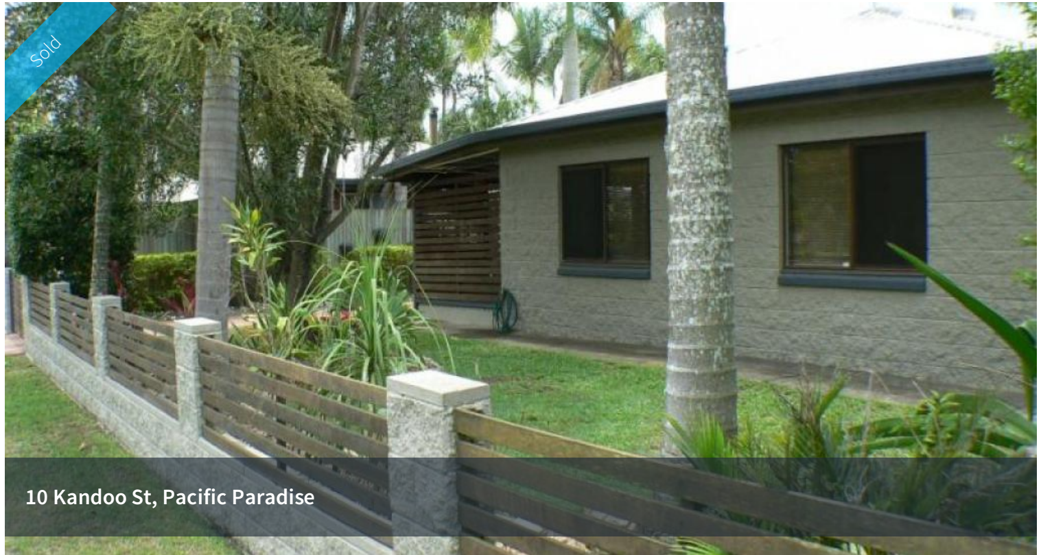
10 Kandoo St, Pacific Paradise