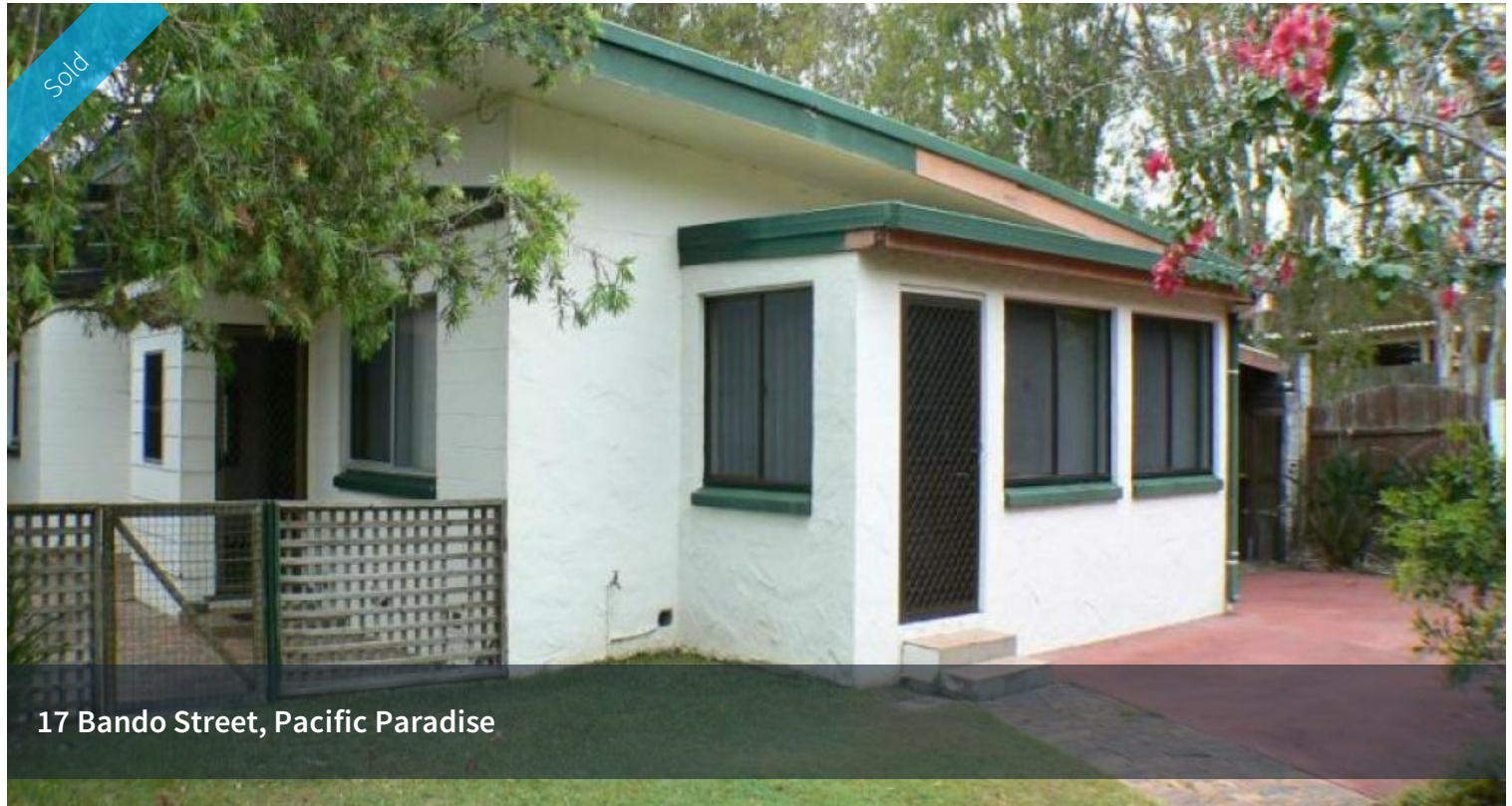
17 Bando Street, Pacific Paradise