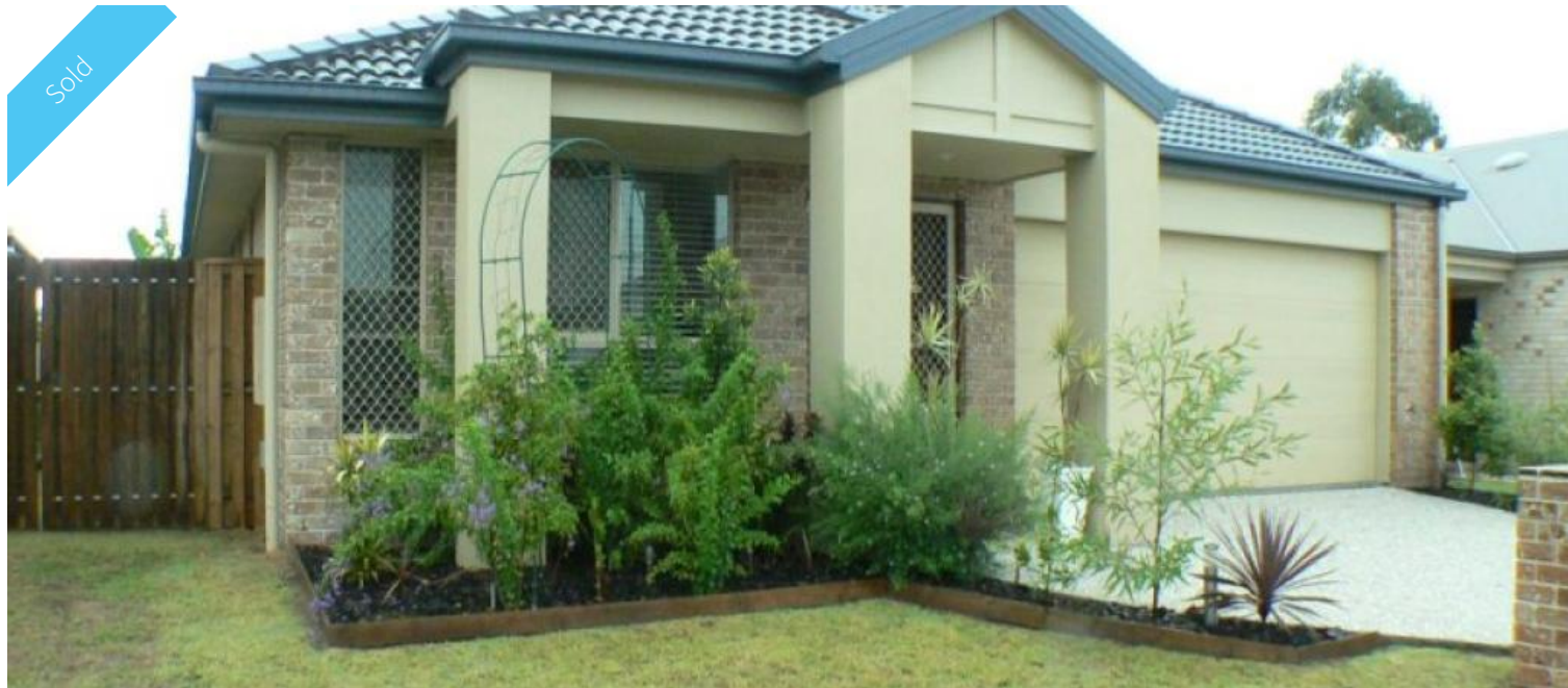
8 Fitzroy Court, Pacific Paradise