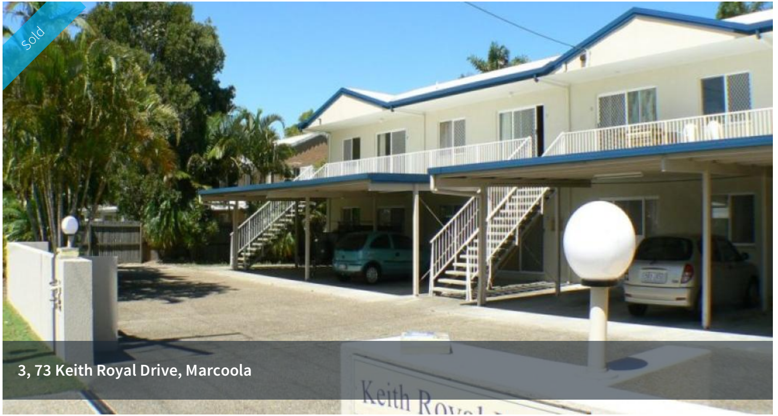
3, 73 Keith Royal Drive, Marcoola