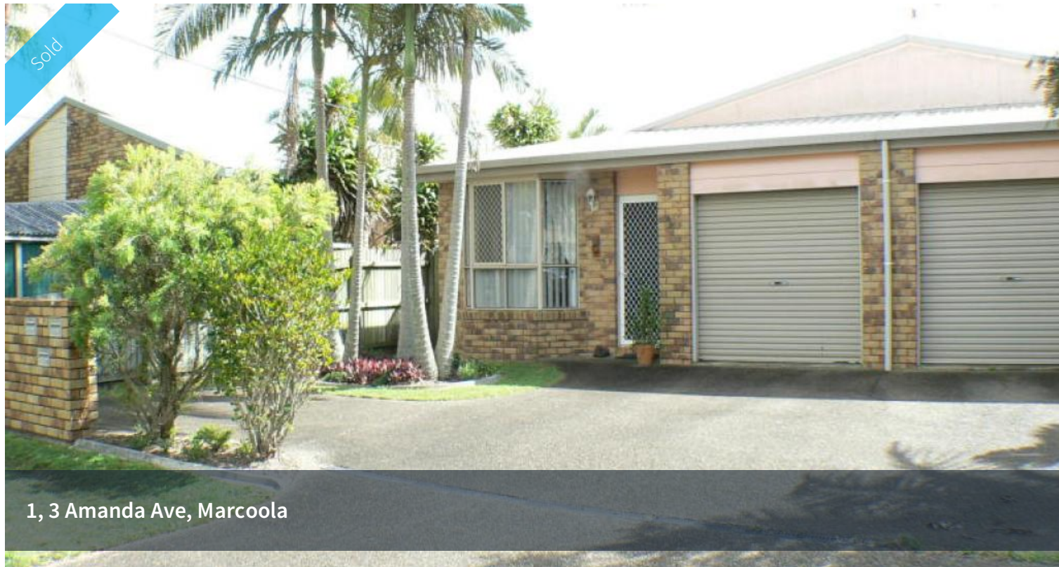
1, 3 Amanda Ave, Marcoola