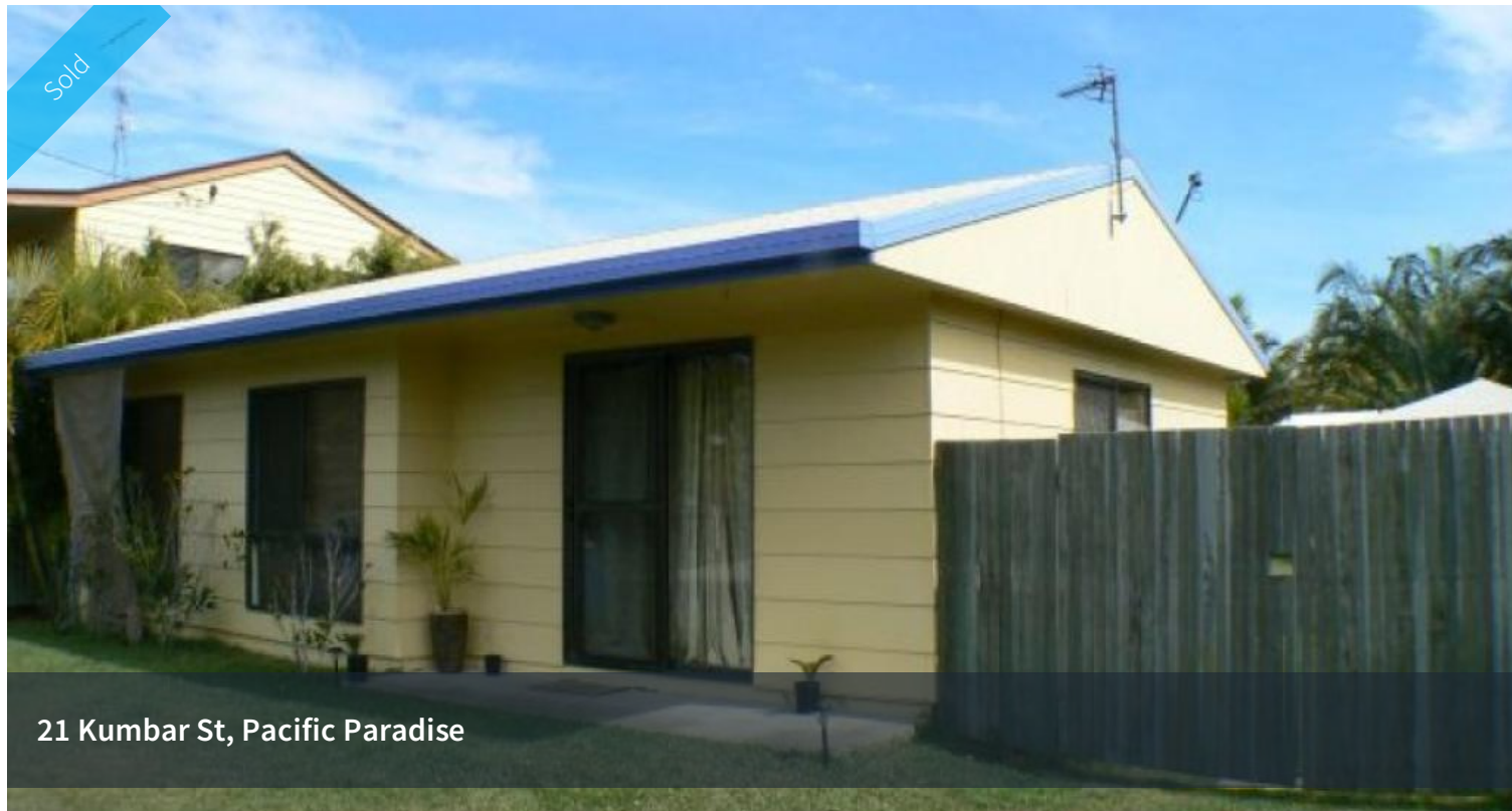
21 Kumbar St, Pacific Paradise