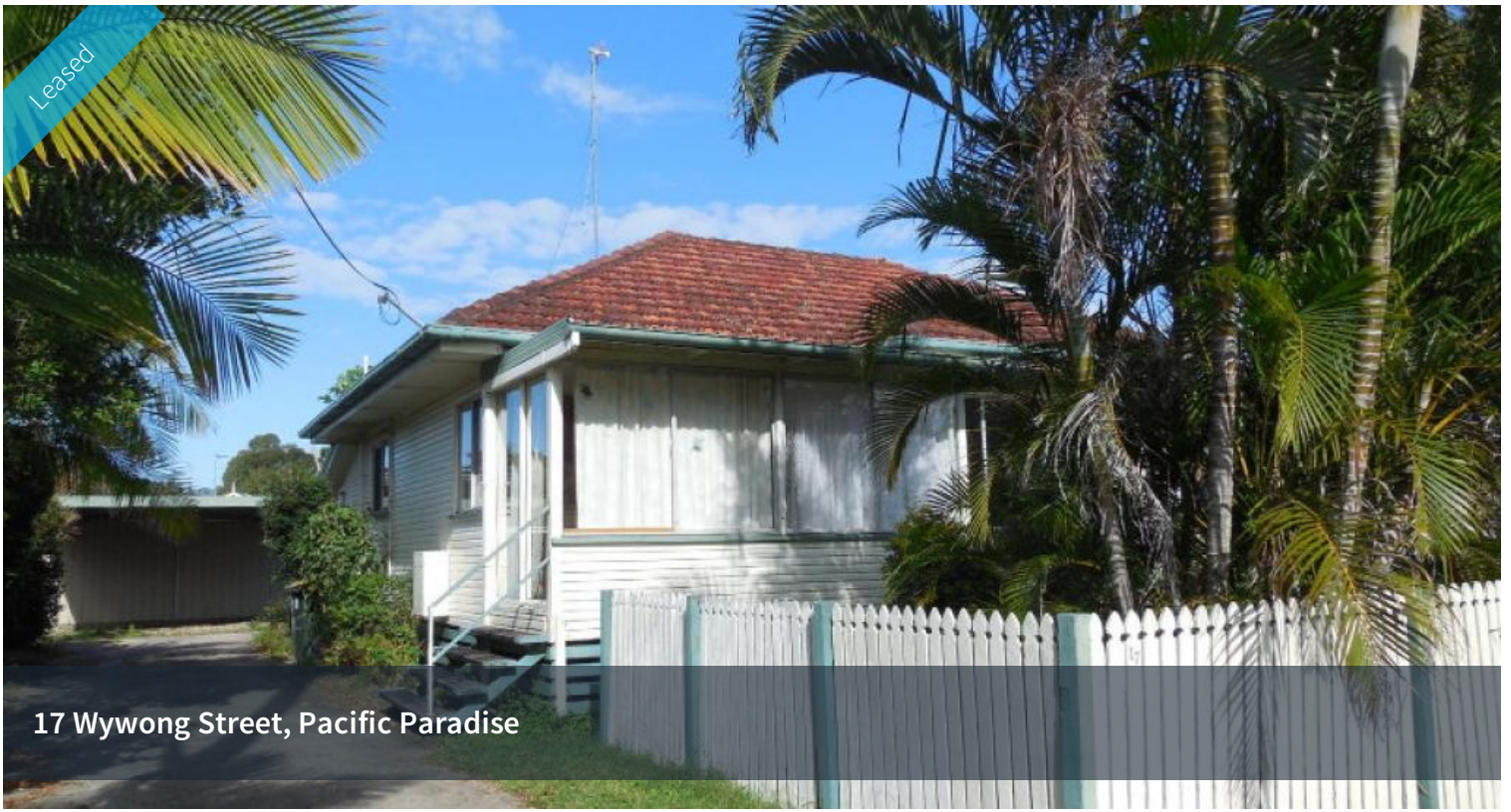
17 Wywong Street, Pacific Paradise