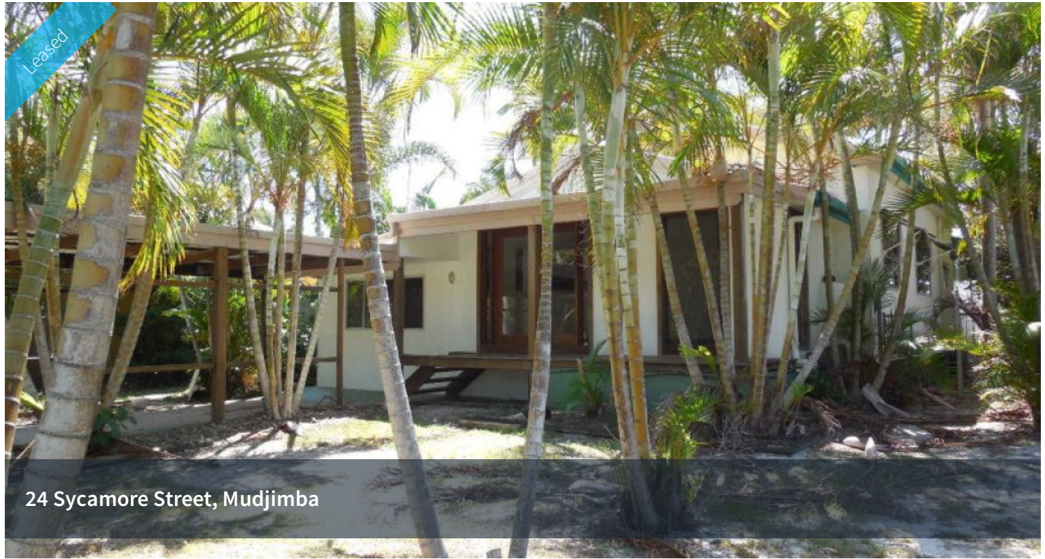
24 Sycamore Street, Mudjimba