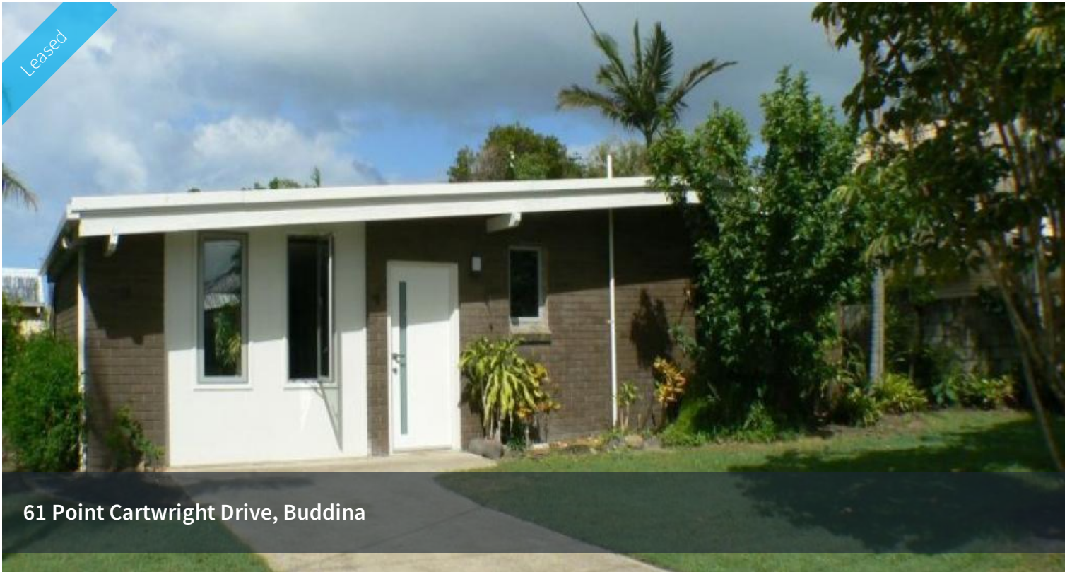
61 Point Cartwright Drive, Buddina